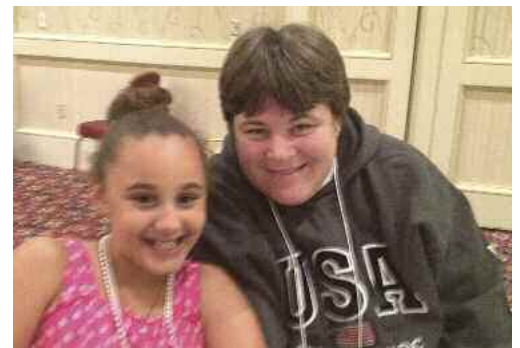
Minnesota Friends at the OI Conference

Research: The Bennett Clayton Foundation continues to meet its annual commitment to the OI Foundation in support of the Linked Clinical Research Clinics. According to the OI Foundation, LCRC are a nationwide network designed to provide the highest-quality of standardized medical care for people living with Osteogenesis Imperfecta. All of the LCRC sites have a multidisciplinary group of specialists with extensive experience caring for children who have OI. In addition to providing high-quality standardized care, the LCRCs, through a coordinated effort, will aim to advance standards of care and improve treatment through clinical research. By sharing data, the Centers will be capable of tracking how OI changes across a lifetime, what complications are common, and which treatments are beneficial.