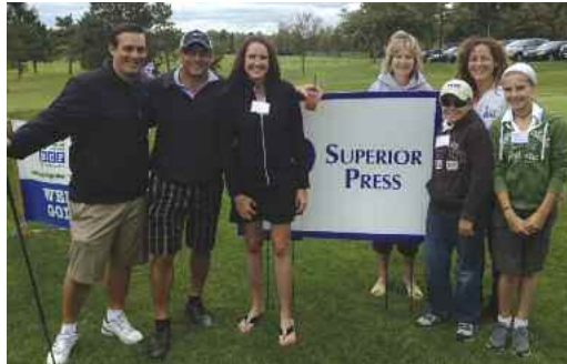
Left: 2012 Wells Fargo Charity Golf Event