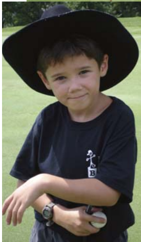
The Boy in Black